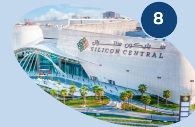
8 Silicon Central Mall