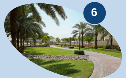
6 North Park