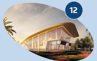
12 Blue Line Metro (Upcoming Development)