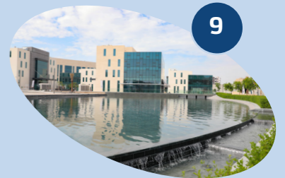
9 Dubai Digital Park