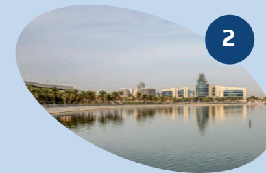
2 The Lake