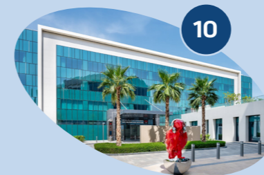
10 Radisson RED