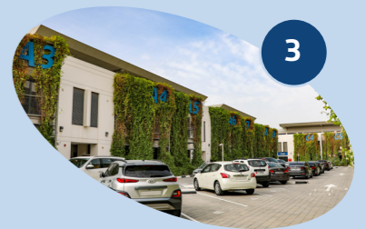
3 Light Industrial Units & Warehouses