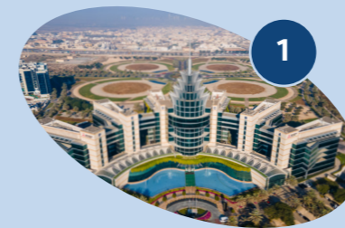
1 Dubai Silicon Oasis HQ