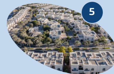
5 Cedre Villas