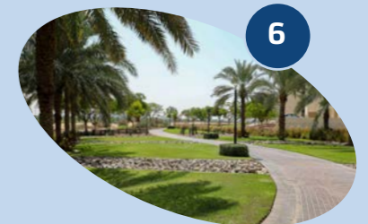
6 North Park