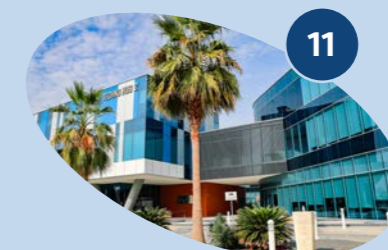
11 Techno Hub