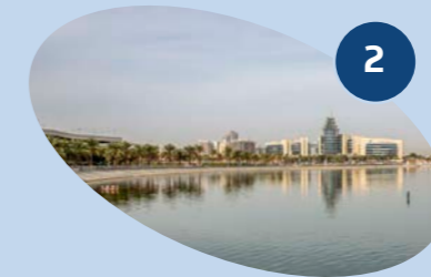
2 The Lake