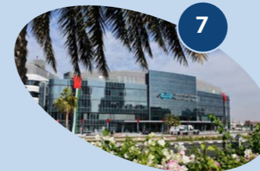
7 Fakheh University Hospital