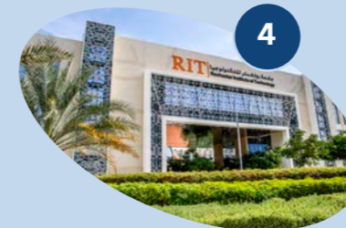
4 Rochester Institute of Technology