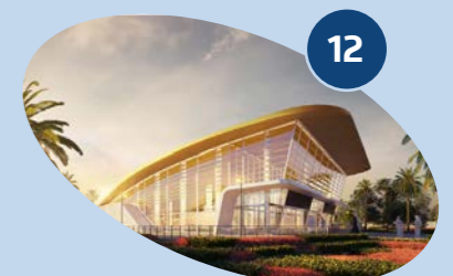
12 Blue Line Metro (Upcoming Development)