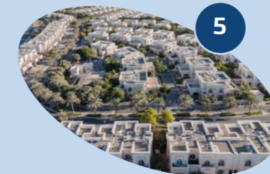
5 Cedre Villas