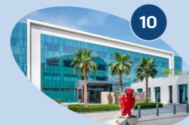
10 Radisson RED