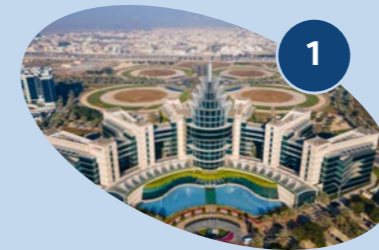
1 Dubai Silicon Oasis HQ