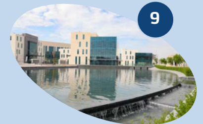
9 Dubai Digital Park