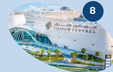
8 Silicon Central Mall